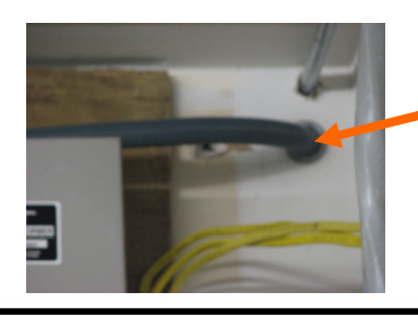
Left: Close up of Parans Optical Cable bundle entering the building through 1.5" conduit

Close up of SP2 Solar Panel, mounted at 39 degree angle to match latitude. Each lens has a 120 degree range of motion on two axis to track and concentrate the sunlight