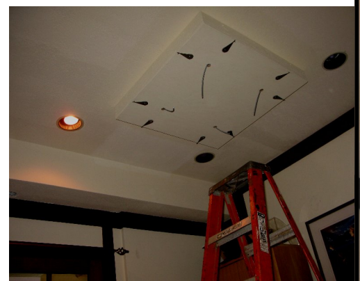
Above: Dark room with electric lights on.

<u>Result</u>: The Parans system was used because this room is in the basement of the house, and the ability to install the fiber optic cable inside the walls made it the only solution.