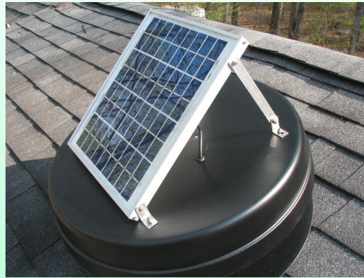
Top view of the Original Attic Fan with an adjustable panel mounting system