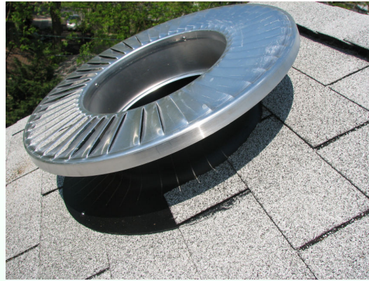
Louver ring of solar attic fan before installation of panel and motor shroud