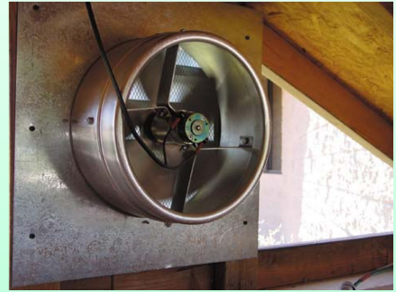
Interior view of Gable Vent with remote mount solar panel

All components are made from high quality aluminum and powder coated for longevity. We do not use any plastic or steel for the exposed portions of these durable products.