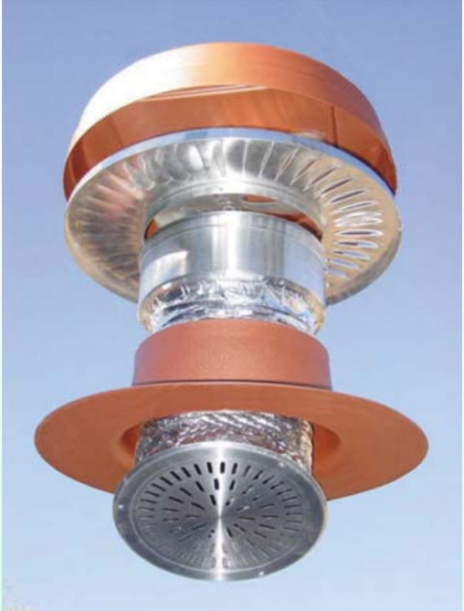
Expanded view of Solar Powered Garage Vent