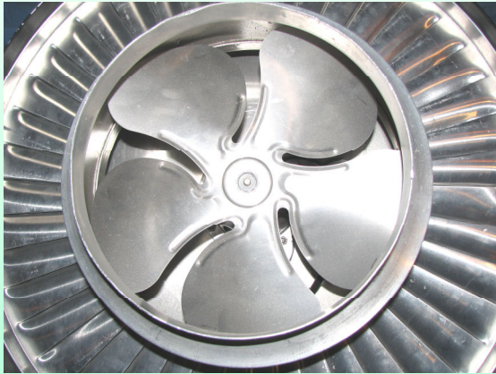
(view of fan blades and louver)

HUVCO is proud to offer these solar powered ventilators, specially designed and engineered to move up to 800 CFM of hot air from the attic or garage. One unit is capable of ventilating an attic space of up to 1200 square feet (depending on the height of the attic).